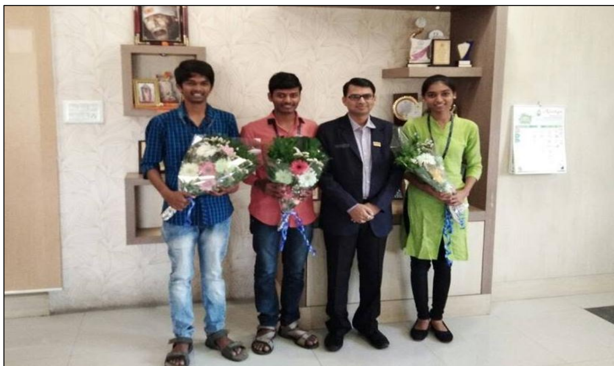
Felicitation of the students who clinched the first step of success by clearing the GPAT exam 2017