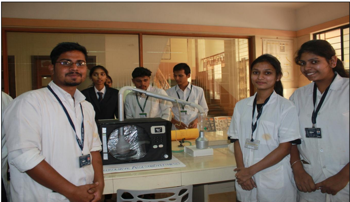
Group of B. Pharm Students displaying their model in Model making Competition on World Scientific Day