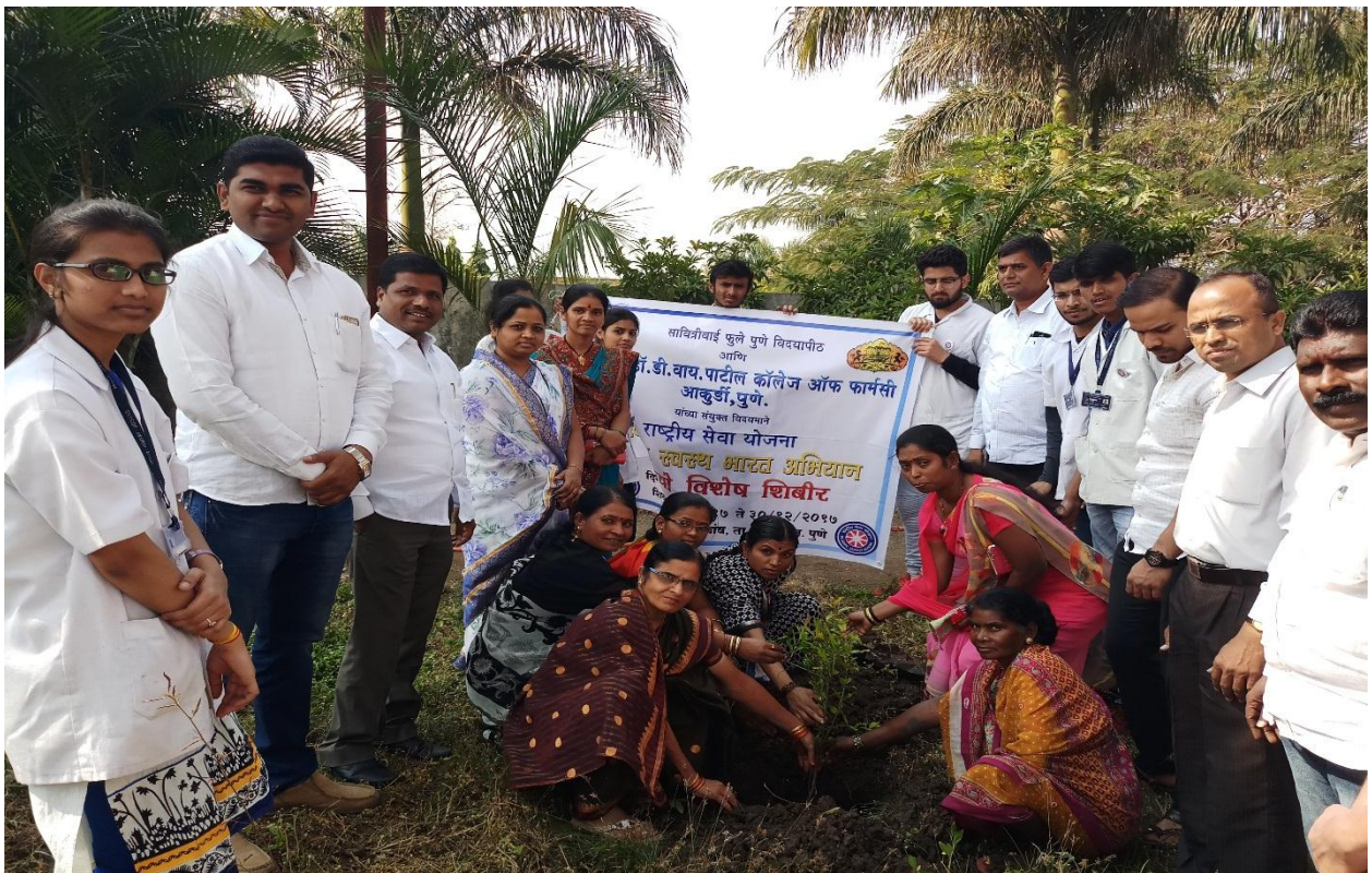
Planting roots of plush greenery, at the Swaccha and Swashta Bharat Abhiyaan