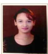
Wagh Rasika 8.615 (SGPA)