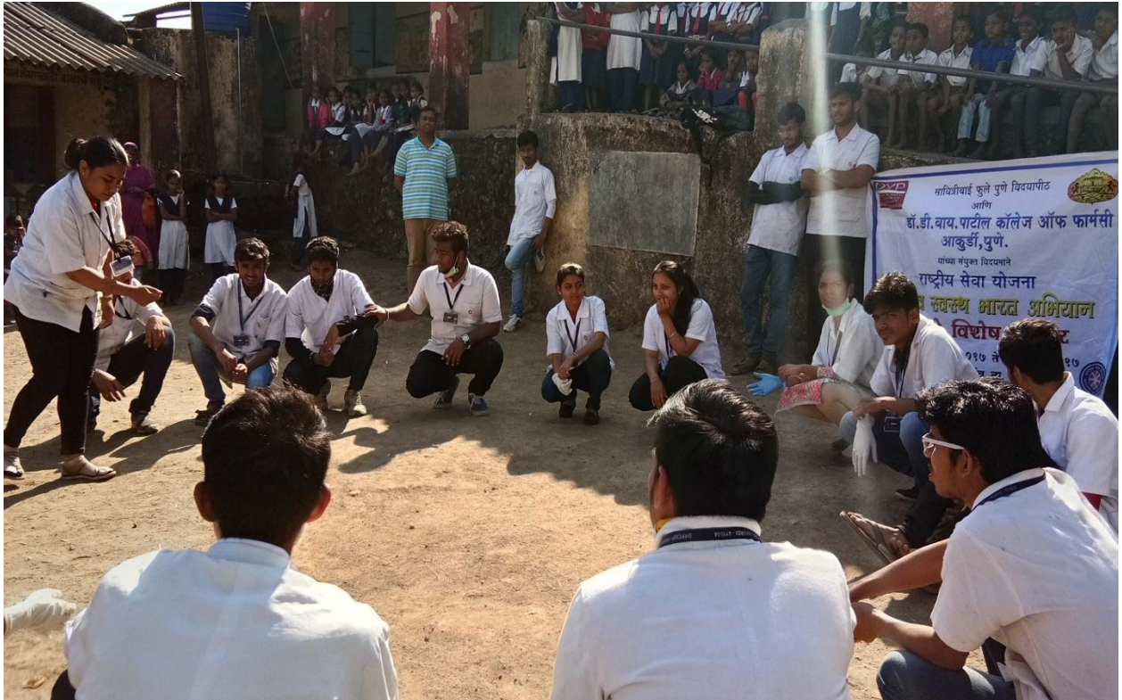
Spreading the wings of awareness, through socio-cultural rooted street play