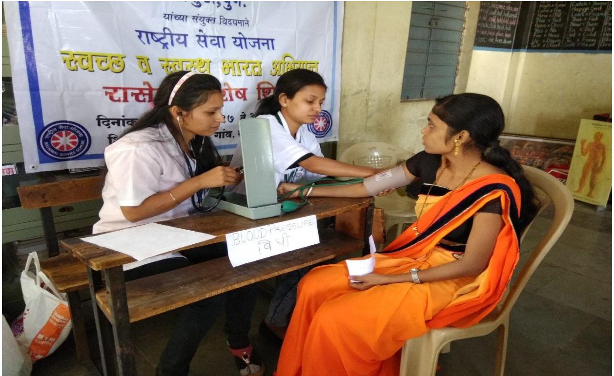
Helping the villagers keep up with their sound health, through the health check-up camp, Kanhegaon