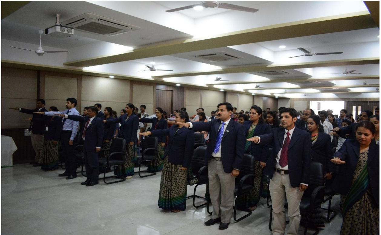
Stakeholders of the college, taking the 'Swachhata Pledge' under the Swachh Bharat Abhiyan, at Dr. D.Y. Patil College of Pharmacy, Akurdi, Pune