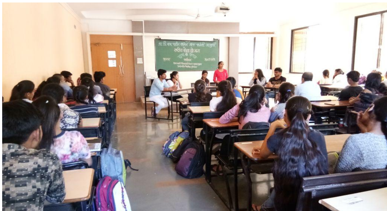
Empowering the youth through co-curricular activities at the Yuva Saptaha conducted at Dr. D. Y. Patil College of Pharmacy, Akurdi, Pune