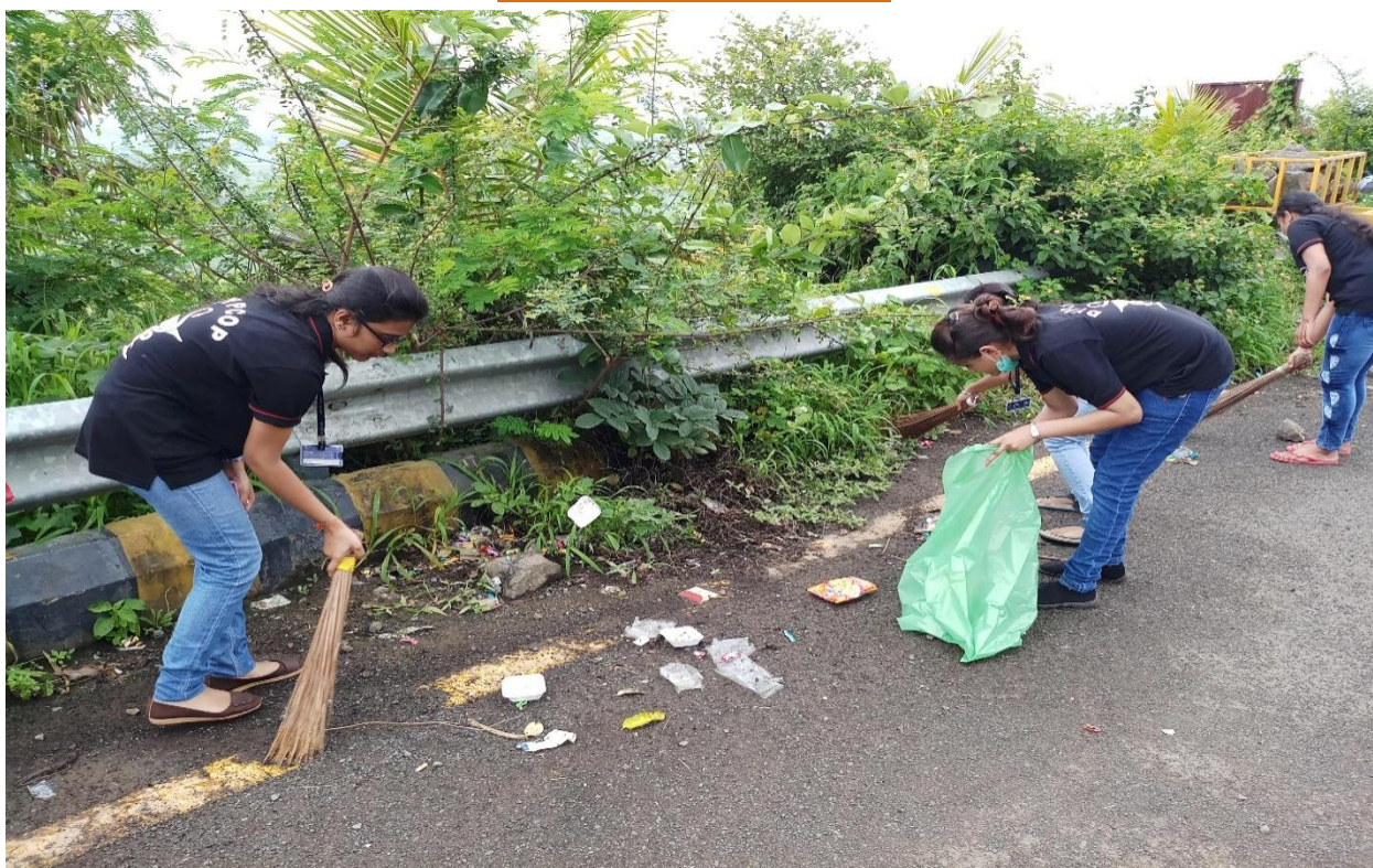
Our NSS student Volunteers, being the change we want to see in the world of cleanliness, under the cleanliness drive, at Bhandara fort on 11 th August 2017