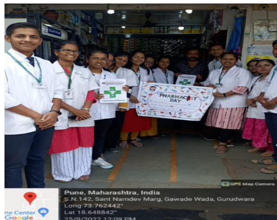
Students of DYPCOP felicitating pharmacists and spreading awareness about OTC medicines on occasion of World Pharmacist Day