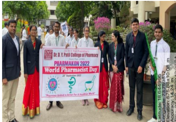
Glimpses of Pharma Rally organized at DYPCOP on the eve of World Pharmacist Day