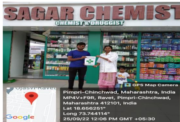
Faculty of DYPCOP felicitating pharmacists and spreading awareness about OTC medicines on occasion of World Pharmacist Day