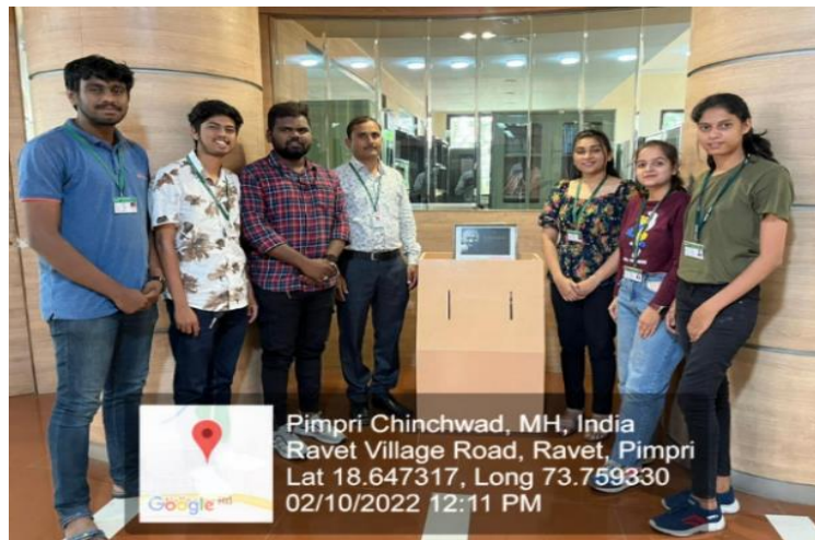
Mahatma Gandhi Jayanti Celebration at DYPCOP