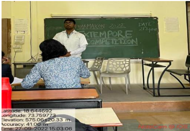
Glimpses of Elocution competition organized at DYPCOP on the eve of World Pharmacist Day