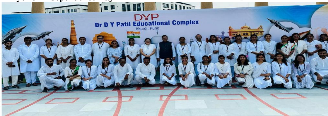
Independence Day celebration