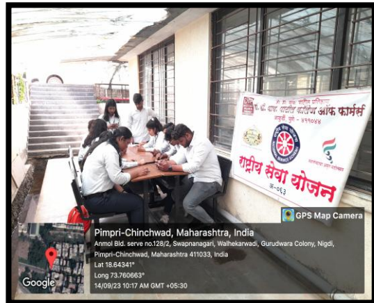
Voter ID registration camp