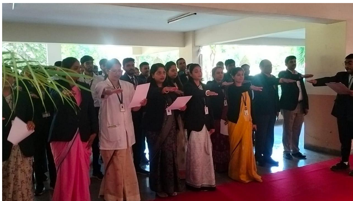
Constitution Day Celebration at DYPCOP